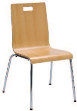
9222 Seat height - 18"