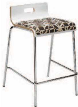
CT9333 Seat height - 25"