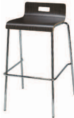
BR9333 Seat height - 30"