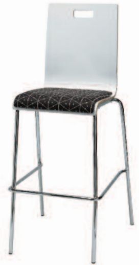
BR9222 Seat height - 30"